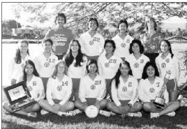
1981 Vulcan Volleyball Team