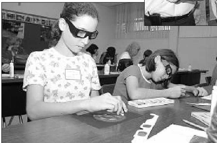
Budding scientists take part in one of the 22 workshops offered.