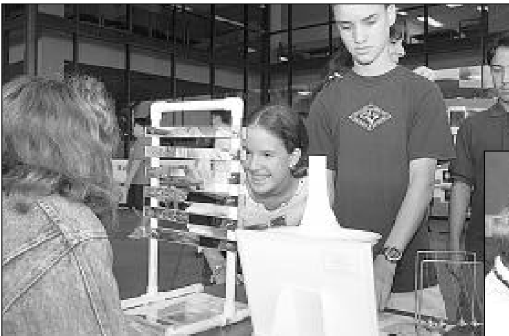
Participants enjoy one of the many displays and exhibits on the library lanai.

Sponsored by American Savings Bank, NASA, Mauna Kea Astronomy Education Center (MKAEC) and UH Hilo.