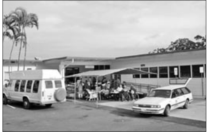
Parking Lot area converted to a Dining Room and Recreation area.

That afternoon the staff of Hale Ho'ola began transferring residents next door to the UHHilo facility. Forty-nine residents spent the week in the Center's air conditioned Conference Room and Distance Learning Lab before returning to Hale Ho'ola on Friday afternoon. During the week, numerous community volunteers came to provide any assistance that was