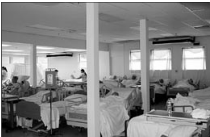
Conference Room converted to the living area for 42 residents.