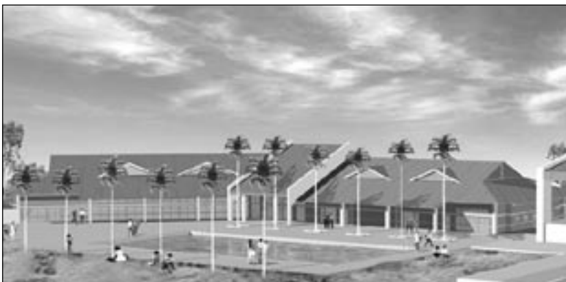
Current rendering of Student Life and Events Center.

UH Hilo officials began pursuing the project approximately 10