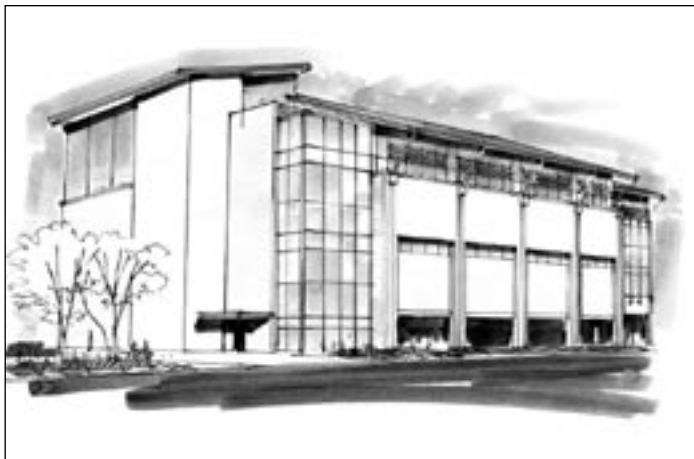
Rendering of Science and Tech Building

Original plans to also house the Biology Department