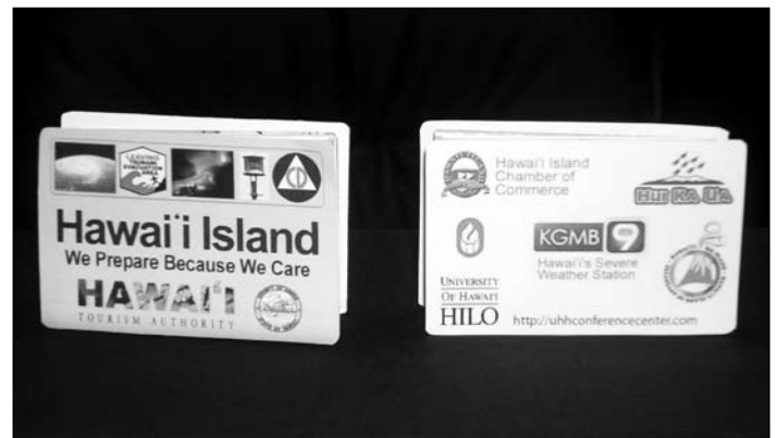
Hazard Preparedness Pocket Card