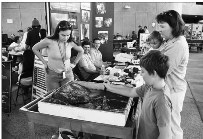
A CSAV display at Onizuka Science Day

Please call the Conference Center if you're interested in participating as a presenter or if you'd like to offer a hands-on workshop for students. For information, contact Judith Fox-Goldstein at foxgolds@hawaii.edu or call x47555.