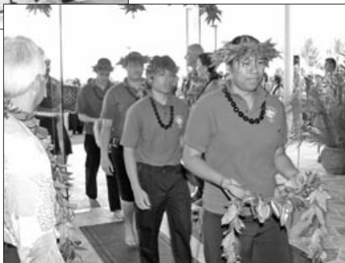
Students from Nawahiokalani‘opu‘u School enter ‘Imiloa Astronomy Center bearing Ho‘okupu (gifts) from the Hawaiian Societies and other organizations at the blessing ceremony to open the new Center.