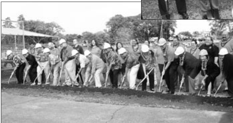
Dignitaries in action