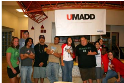
UMADD sponsored Wii night!

The deadline for priority consideration is April 1, 2009.