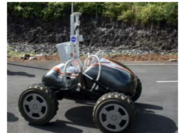
NASA Rovers were shown by UH Hilo students on Saturday to the community., up at the Astronomy center.

Students from UH Hilo Walked a Mile in Her Shoes this week to help spread the word about domestic violence. (above picture of two students in Heals ) A special thanks to the UH Hilo Athletes for showing up in force and showing what grace you have on and off the field!