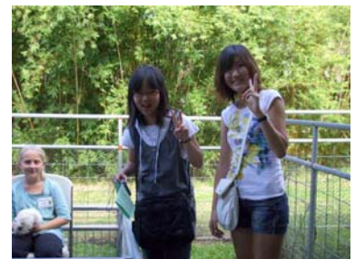
Having a blast at the Zoo

Additionally , Resident Life Programming recently held this semester's first trip to the Zoo! On Saturday, November 1st, students played at the petting zoo and danced at the lemur cage. If you're interested in another Zoo trip, or in a trip to other locations you want to see, come to the RLP office in Ikena and we'll discuss it.