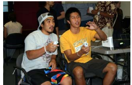
Playing Wii on Wii Night

October 24th kicked off the beginning of Wii Nights. RLP is currently looking for a new location, so a date for the next Wii Night has not been set yet. Once a date has been set it will be announced in Around da House and